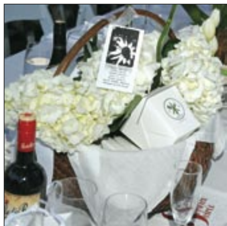
Hollis' Basket with Arrangement