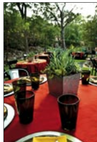
Publicity Ranch table setting