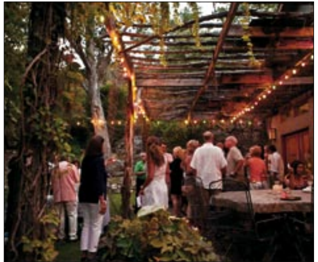
Parman Cabin Patio