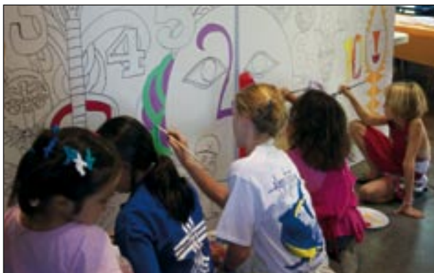
SAMA visitors painting the 1, 2, 3, Sí! mural