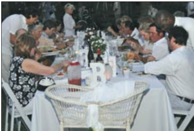
Landa Library Garden dinner guests