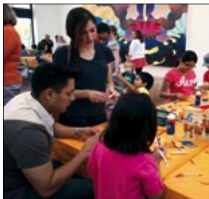
4 SAMA visitors participating in the 1, 2, 3, Sí! family art activities