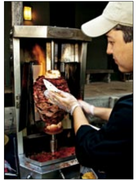
Tacos a la pastor